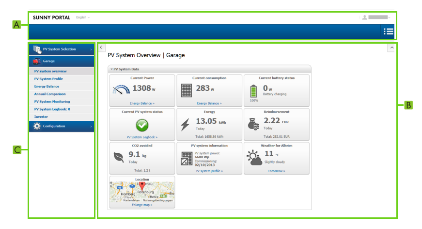
Figure 1: User interface of Sunny Portal (example)