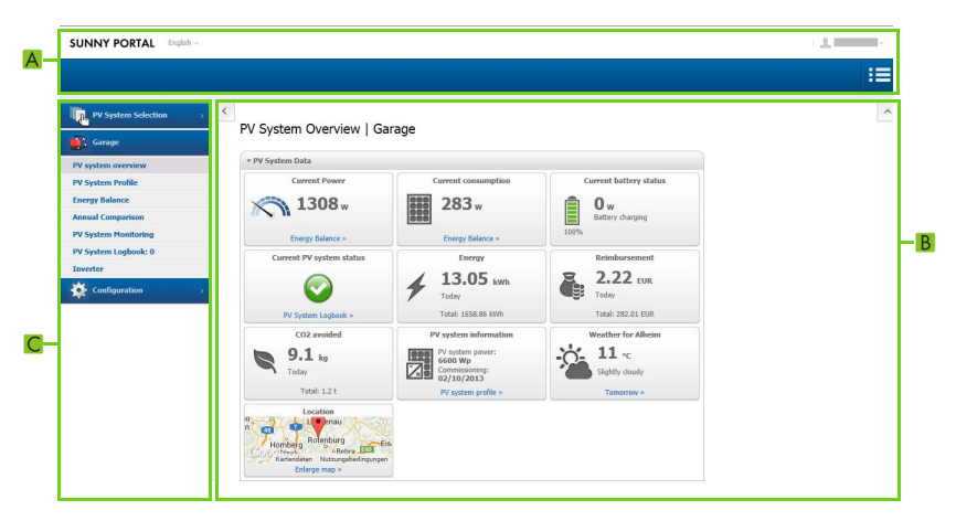
Figure 1: User interface of Sunny Portal (example)